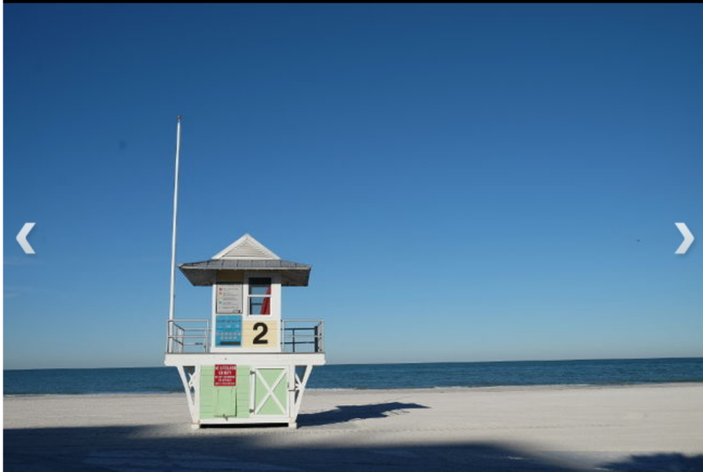
Clearwater Beach is often voted one of the best in the United States. There's something for everyone on this stretch of sand.