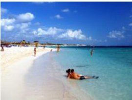
Mayan Riviera Beaches 8 Photos