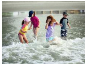
Best East Coast Beaches