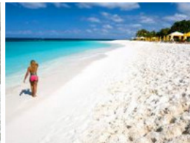
Best Caribbean Beaches 10 Photos